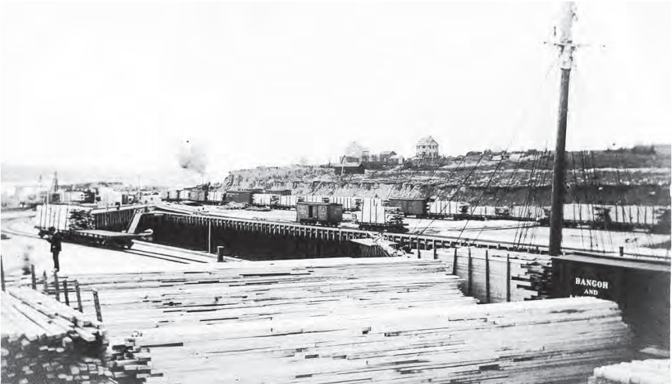
Top: Boats line up for cargo at the Cape Docks. Bottom: Trains carry lumber to be loaded onto ships at the docks. The old hotel stands in the distance. When the Cape Docks were active, lumber, paper, potatoes, and more were shipped out and coal, fertilizer, bricks, and cement received. In those days, Stockton Springs had about 1,100 residents and two newspapers.