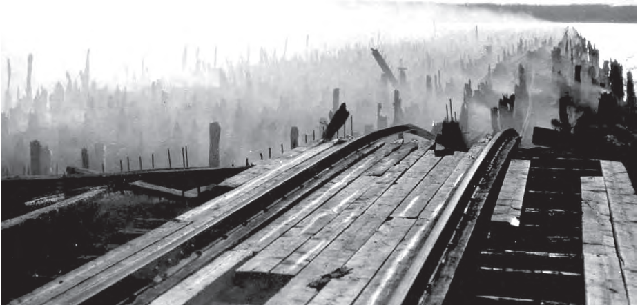
In 1924, the Cape Docks piers burned to the water. Only pilings remained.

varnished. Made a nice wall, nothing like these today. Dark wood. It was a good-sized room, there were desks in it; that was the office.